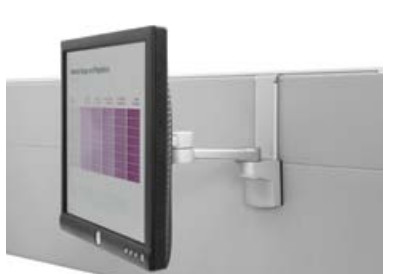
Lexicon panel mount