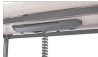
Cable Tray + Cable Chain