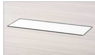
Integrated Top Access