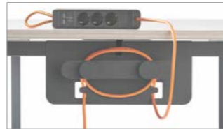
Power Hook with Flex Power Hanger