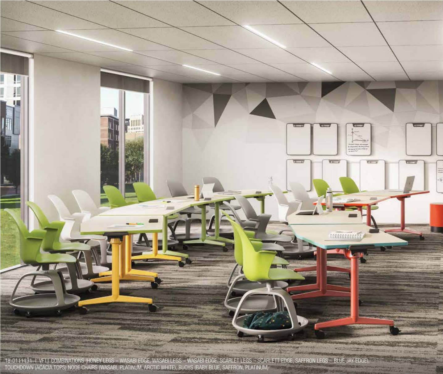
18-0111131 | VFTT COMBINATIONS (HONEY LEGS – WASABI EDGE, WASABI LEGS – WASABI EDGE, SCARLET LEGS – SCARLETT EDGE, SAFFRON LEGS – BLUE JAY EDGE), TOUCHDOWN (ACACIA TOPS) NODE CHAIRS (WASABI, PLATINUM, ARCTIC WHITE), BUOYS (BABY BLUE, SAFFRON, PLATINUM)