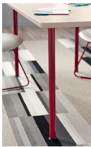
Not Afraid of Heights

Simple Tables come in three heights. Work height for group projects. Cafe height for stools. Lounge height for comfortable productive settings, like the Turnstone Campfire Lounge System.