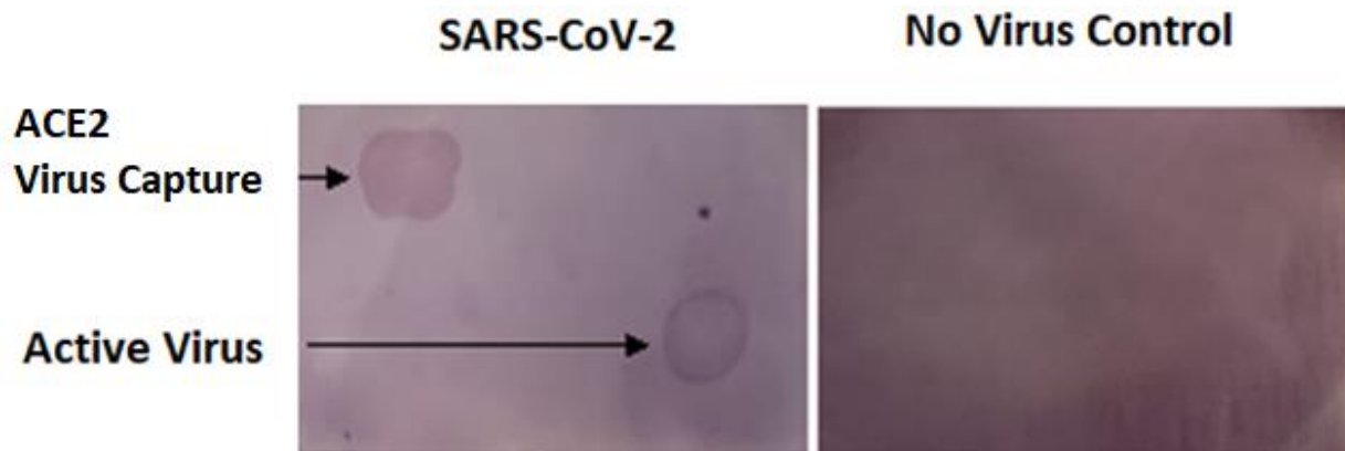
Figure #1: Validated Capture of active (live) SARS CoV-2 with Human ACE2 Protein

Given the ACE2 protein could be used to bind recombinant SARS CoV-2 RBD-Spike protein using a BioCloud prototype it was next determined whether intact whole SARS CoV-2 virus could also be “captured” via ACE2 protein. To determine whether this could be established experiments using active SARS Cov-2 were performed by qualified personnel in the level III biocontainment facility at the University of Western Ontario . In addition, a commercially available anti-SARS Cov-2 antibody directed towards the viral spike protein was purchased for the purpose of whole virus detection.