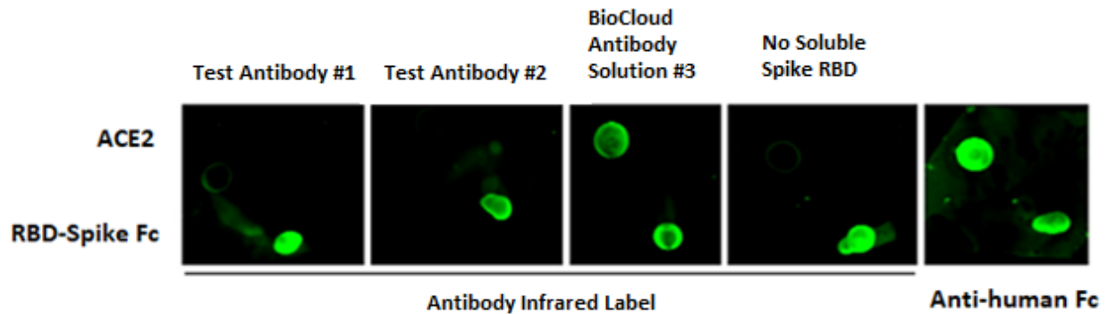
Figure #2: Validation of BioCloud Antibody Solution Detection of SARS CoV-2 Virus

Continued testing of the SARS CoV-2 spike neutralizing antibody where performed. It was noted that consideration to the detection and long-term monitoring for variants of the SARS CoV-2 virus would be of great significance to the success of the BioCloud unit.