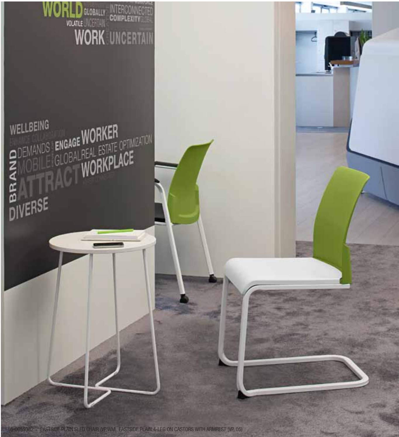
16-0059382 | EASTSIDE PLAIN SLED CHAIR (VP,WM), EASTSIDE PLAIN 4-LEG ON CASTORS WITH ARMREST (VP, 05)