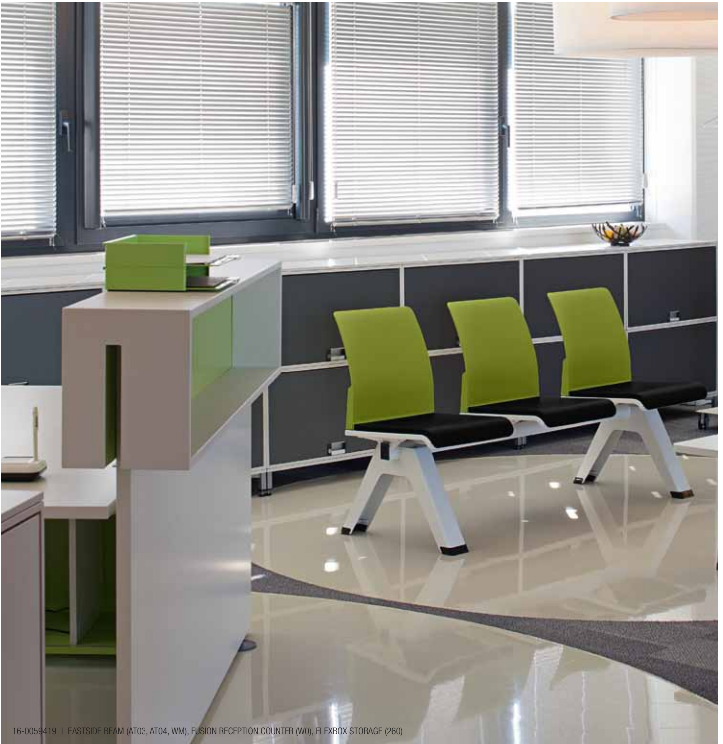
16-0059419 | EASTSIDE BEAM (AT03, AT04, WM), FUSION RECEPTION COUNTER (W0), FLEXBOX STORAGE (260)