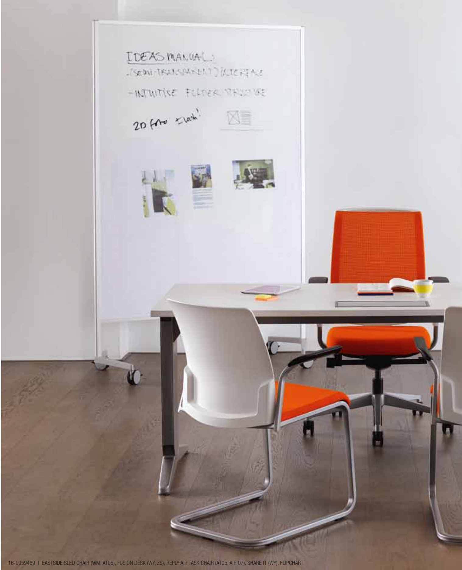
16-0059469 | EASTSIDE SLED CHAIR (WM, AT05), FUSION DESK (WY, ZS), REPLY AIR TASK CHAIR (AT05, AIR 07), SHARE IT (WY), FLIPCHART