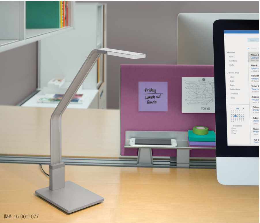
SOTO LED + SOTO EXTENDED LED LIGHTS With a sleek and simple design, SOTO® LED task lighting brings powerful yet unobtrusive illumination.