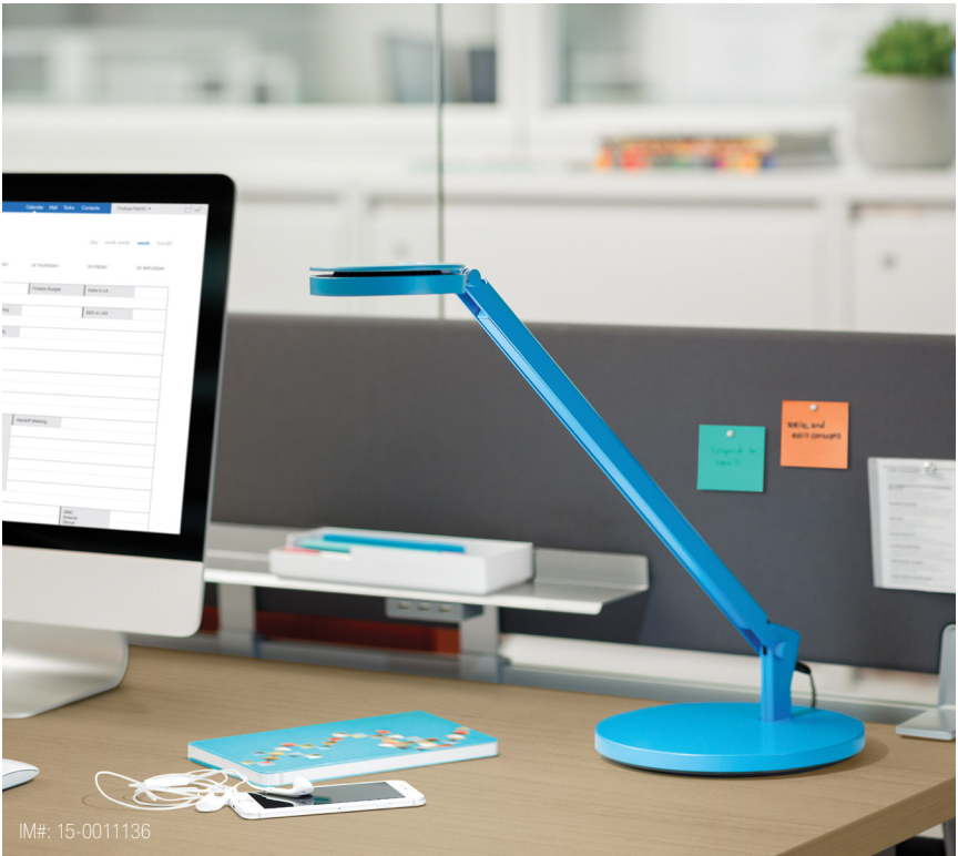
DASH + DASH MINI Featuring clean lines, fluid movement and a timeless aesthetic, each dash® LED Task Light has a high color rendering index of 94, meaning you'll see the true nature of colors.