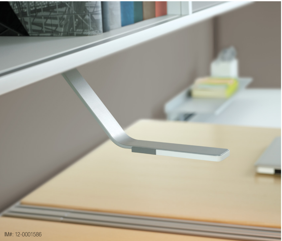
MINI SOTO LED + MINI SOTO EXTENDED LED LIGHTS With the same minimal profile and flexibility as SOTO LED, mini SOTO LED brightens hard-to-reach and hard-to-light places.