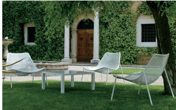
EMU Terramare Studio Chiaramonte/Marin, Italy

The EMU Round Series, designed by Christophe Pillet, is characterized by an elemental design of snug and comfortable shapes, with simple slingback profiles that provide unexpectedly soft seats.