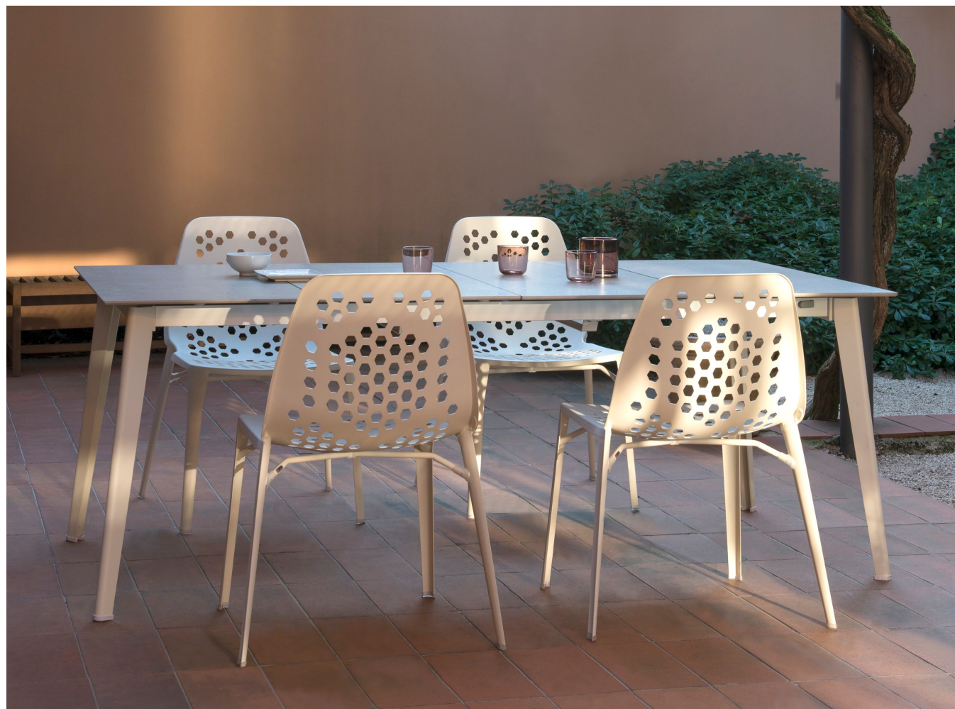
Shown with EMU Kira Table