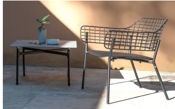
Shown with EMU Lyze Lounge Chair

Simple yet sophisticated, the EMU Kira tables by Christophe Pillet will inspire gatherings of all kinds. Fixed and extending table styles combine durable aluminum frames and porcelain stoneware tops in clean-cut, delicate lines.