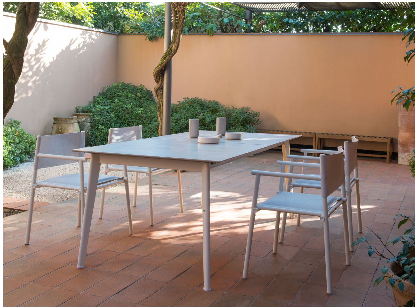
Shown with EMU Terramare Arm Chair