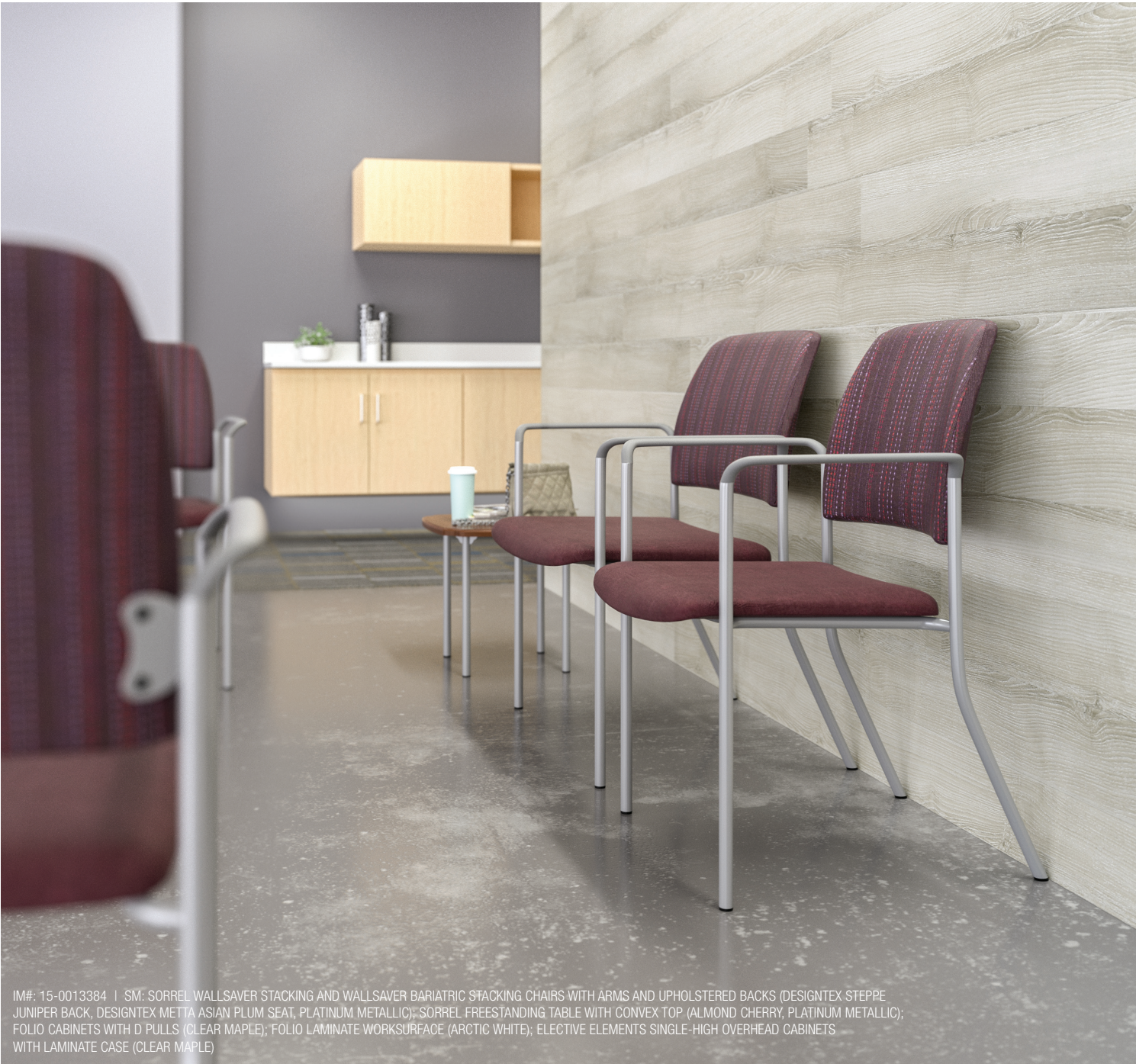
IM#: 15-0013384 | SM: SORREL WALLSAVER STACKING AND WALLSAVER BARIATRIC STACKING CHAIRS WITH ARMS AND UPHOLSTERED BACKS (DESIGNTEX STEPPE JUNIPER BACK, DESIGNTEX METTA ASIAN PLUM SEAT, PLATINUM METALLIC); SORREL FREESTANDING TABLE WITH CONVEX TOP (ALMOND CHERRY, PLATINUM METALLIC); FOLIO CABINETS WITH D PULLS (CLEAR MAPLE); FOLIO LAMINATE WORKSURFACE (ARCTIC WHITE); ELECTIVE ELEMENTS SINGLE-HIGH OVERHEAD CABINETS WITH LAMINATE CASE (CLEAR MAPLE)