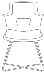
Shortcut X Base Chair with Cushion TS31204A