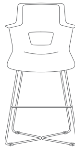
Shortcut X Base Stool TS31205B