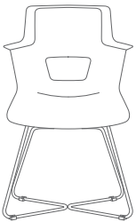
Shortcut X Base Chair TS31204A