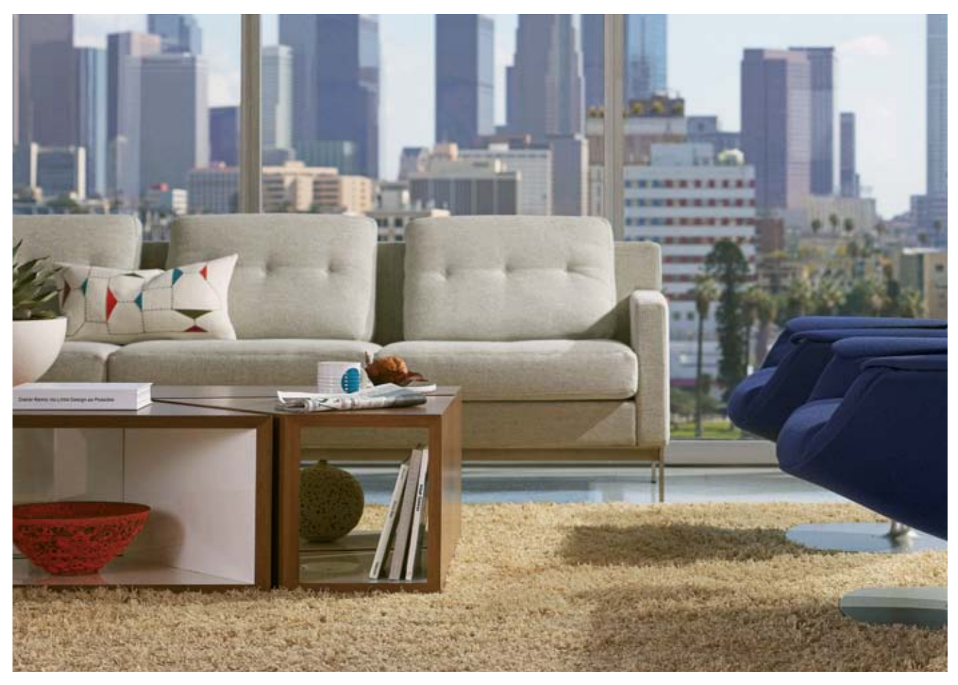
Millbrae Lifestyle seating shown with Sebastopol tables and Massaud Lounge seating

— The soft Lifestyle series is designed for relaxed postures in a social officing setting. It creates a social feel in your workplace. It is generously proportioned with plush cushions and an elegant cross-stitch tufting detail.