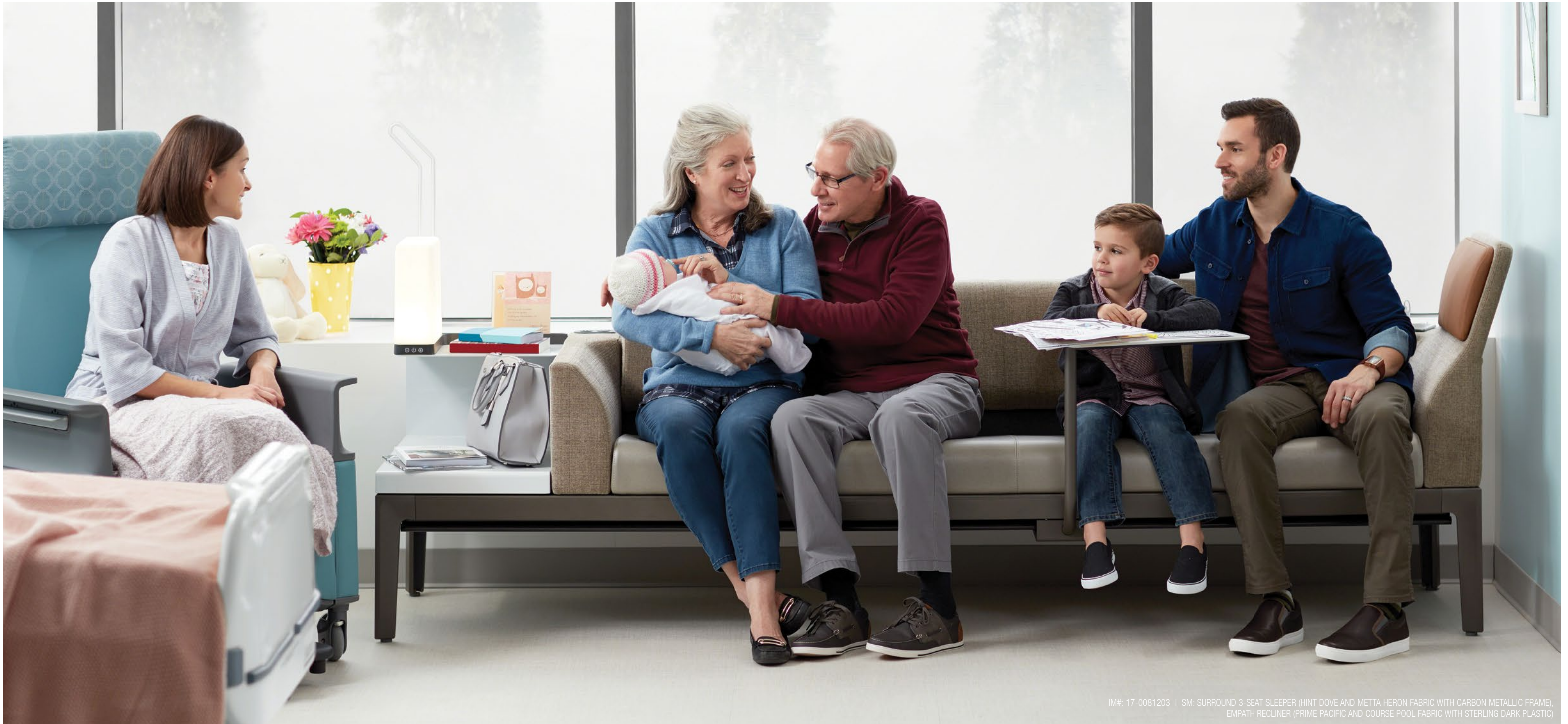
IM#: 17-0081203 | SM: SURROUND 3-SEAT SLEEPER (HINT DOVE AND METTA HERON FABRIC WITH CARBON METALLIC FRAME), EMPATH RECLINER (PRIME PACIFIC AND COURSE POOL FABRIC WITH STERLING DARK PLASTIC)