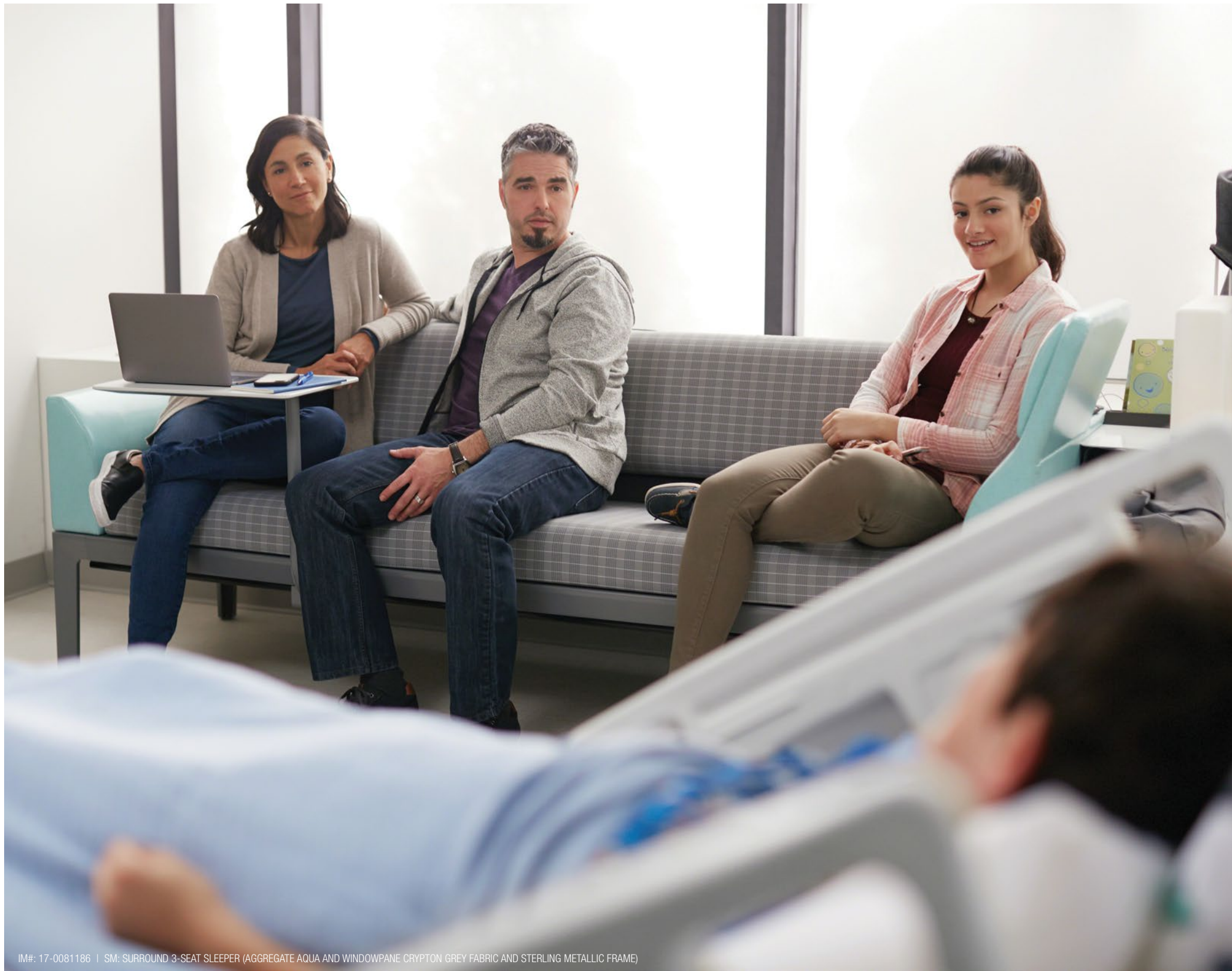
IM#: 17-0081186 | SM: SURROUND 3-SEAT SLEEPER (AGGREGATE AQUA AND WINDOWPANE CRYPTON GREY FABRIC AND STERLING METALLIC FRAME)