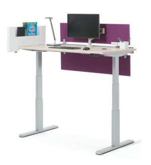
Privacy, modesty, and side screens available.