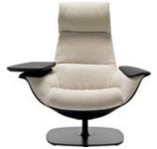
Massaud Work Lounge