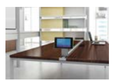
Architectural & Furniture Products