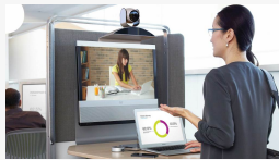
media:scape kiosk is a leading provider of office furniture and technology solutions. We are committed to creating a better way to work for our customers.

Our commitment to innovation and leadership is what sets us apart. We are constantly looking for new ways to improve our products and services. We are proud to be a part of the Steelcase family.