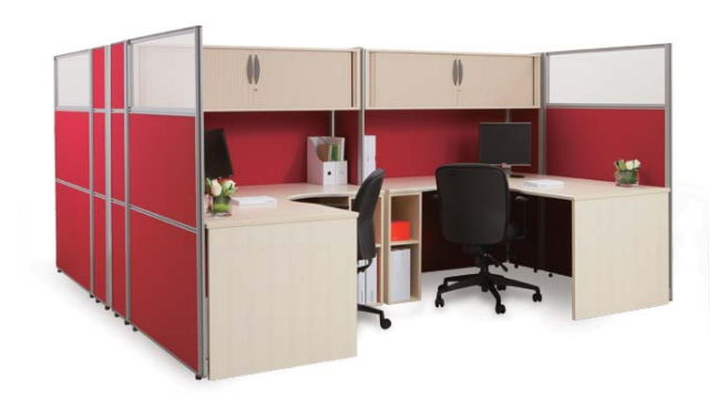
Combining two L-shape worksurfaces supports team collabo ration and individual task work within a shared space.