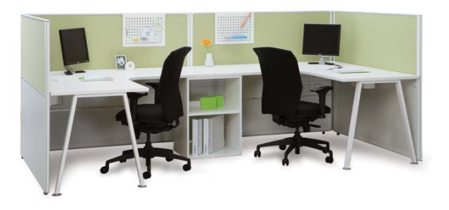
L-shape worksurface creates private space for individual tasks requiring confidentiality and concentration.