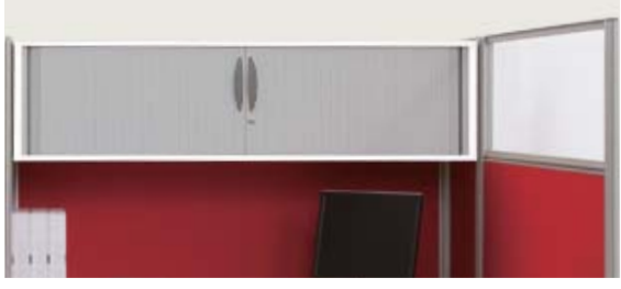
Overhead storage unit