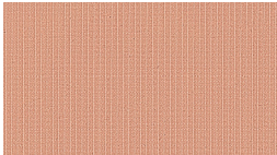
Rose Quartz TE07