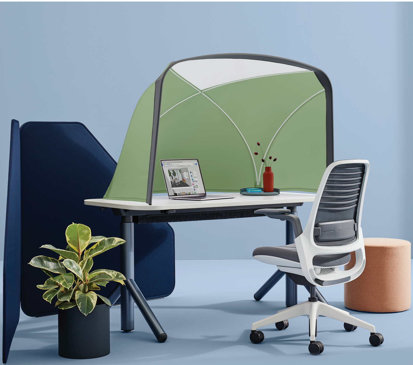
Table Tent provides personal privacy when it's time to focus. With shielding on three sides and overhead, it quickly converts any desk, bench or table into a safe and private place to work. Table Tent is able to accommodate a range of technology and with no clips or clamps it is easy to set up and easy to move.