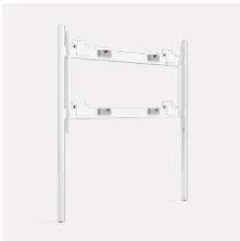
85" Floor Supported Wall Mount