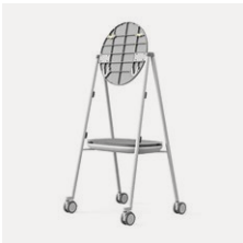
50" Mobile Stand