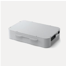
APC™ Mobile Charge Battery

*APC™ Charge Mobile Battery and Microsoft Surface Hub 2S devices sold separately.