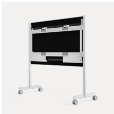
85" Mobile Stand