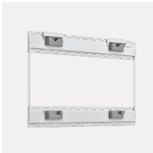
85" Wall Mount