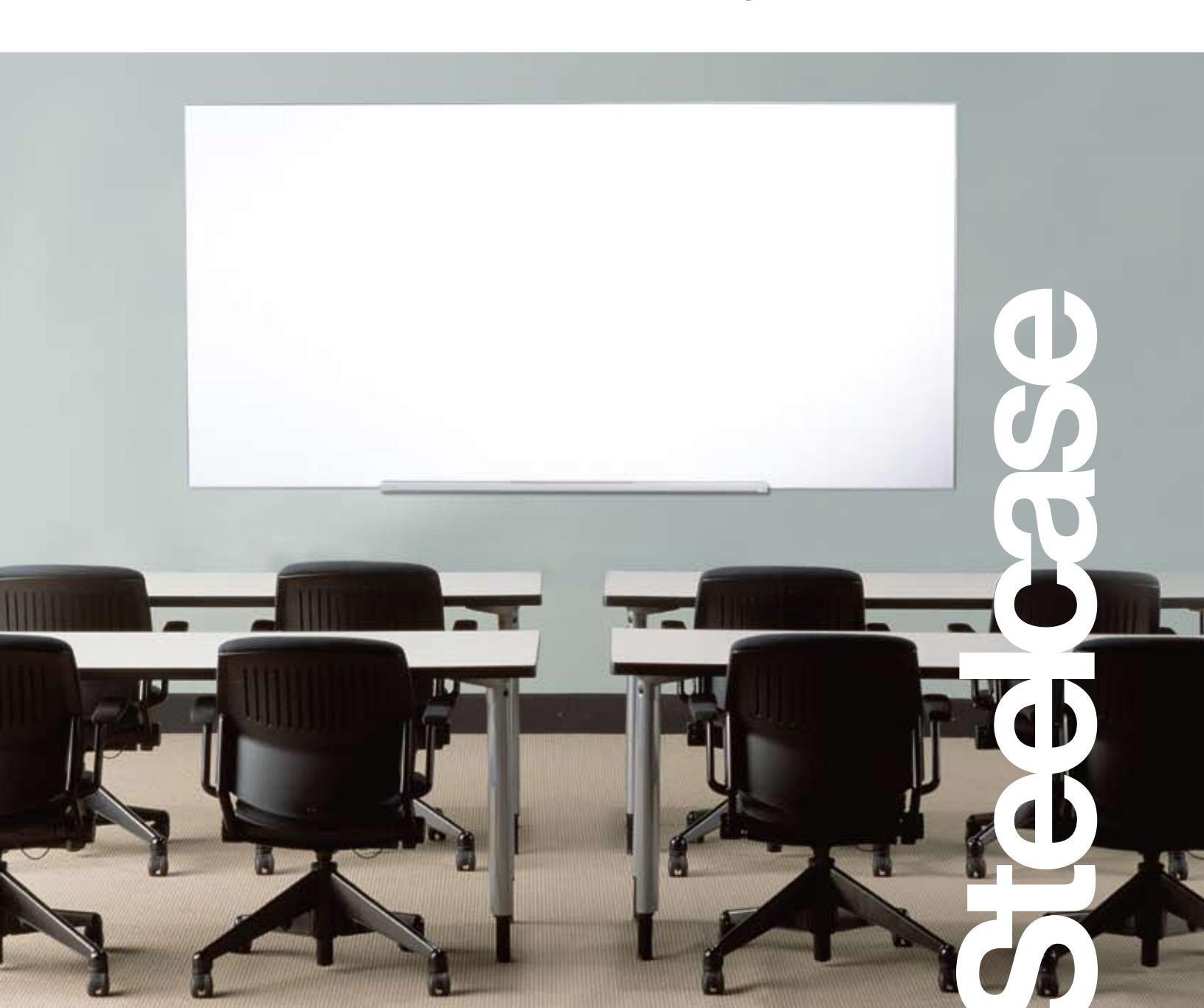
Edge Premium Whiteboard and Tackboard