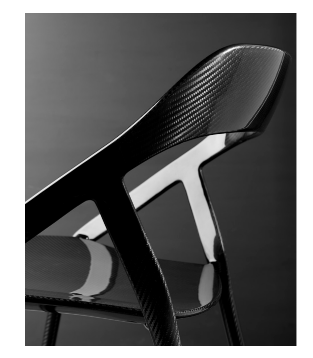
Carbon fiber. At its core are thousands of tiny fibers, woven together into a fabric of unrivaled strength and lightness that enables us to push the boundaries of engineering and design.

The LessThanFive Chair is tailored for an experience that is anything but ordinary. Handcrafted from carbon fiber. Surprisingly light. Exceptionally strong. Weighing less than five pounds.