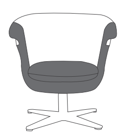
SEAT AND ARMREST COLOUR PALETTE