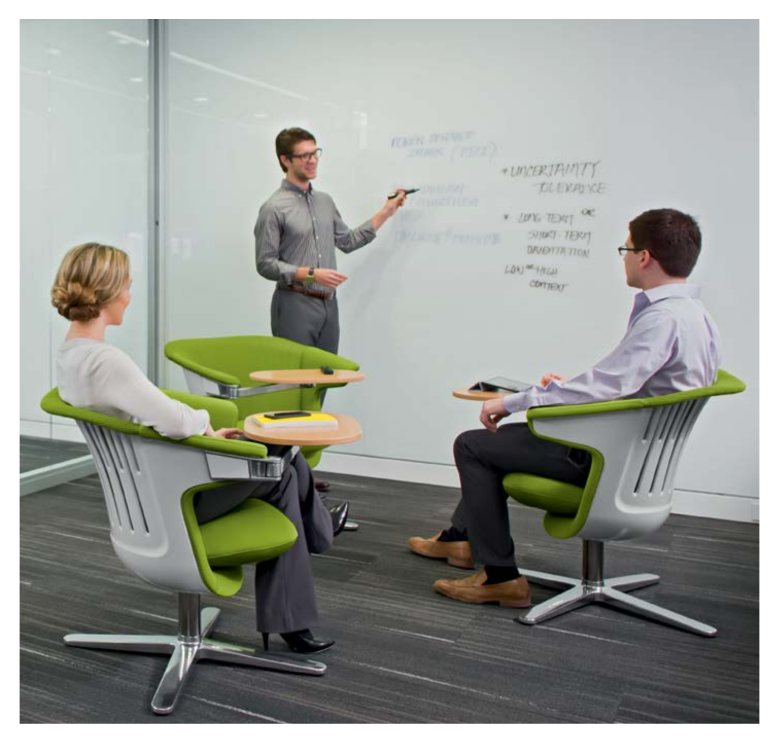
C8817 | i2i CHAIRS (AT03/WHITE/ER)

i2i is also ideal for welcome areas, in-between spaces and small collaborative areas in open or closed office environments.