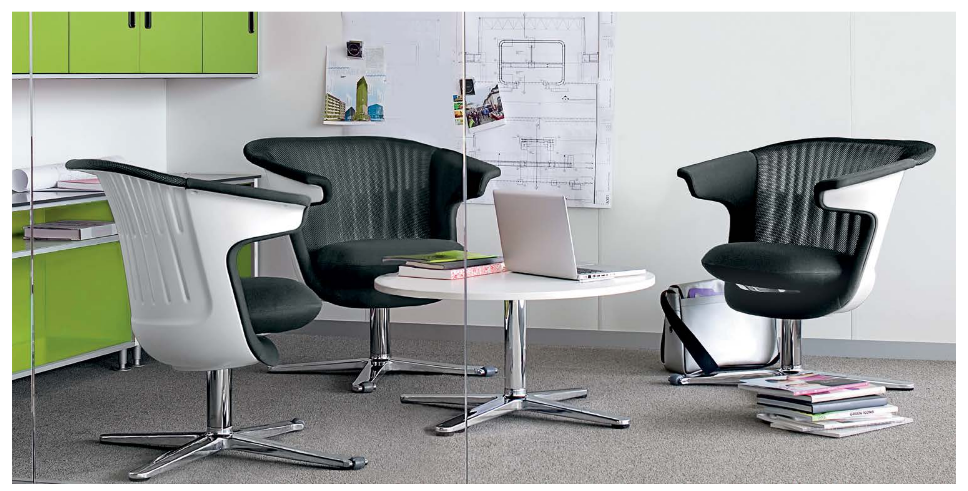
C4831 | i2i CHAIRS (RE03/WHITE), i2i LOUNGE TABLE (WY).