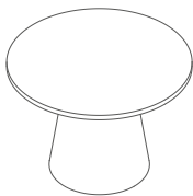
HEP-02 Large work table