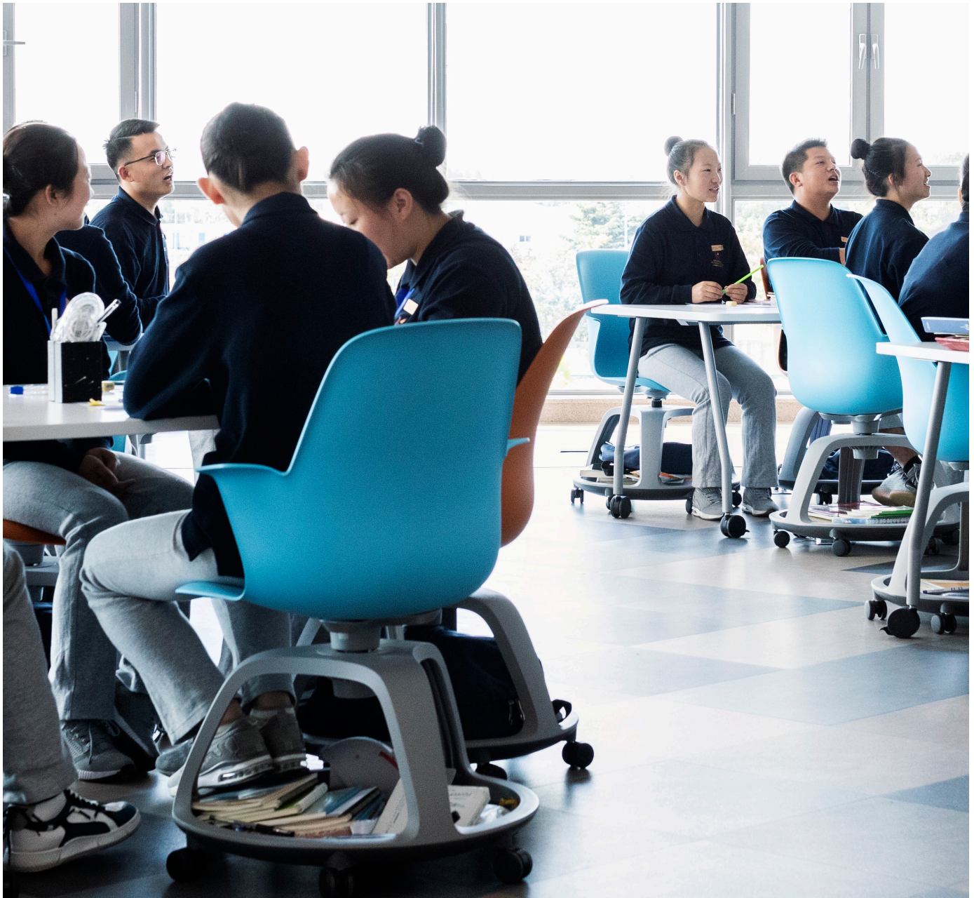
Classrooms in the centre are easy to reconfigure. Here islands are set up to support group work and social interaction.