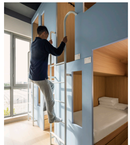
For many of the youth in the centre, the bright and modern capsule dormitories will be their experience of personal space

"We want the youths to feel that they are being respected by creating the 'capsule' dormitory that provides the personal space and sense of belonging that they might have never had before," says Wu.