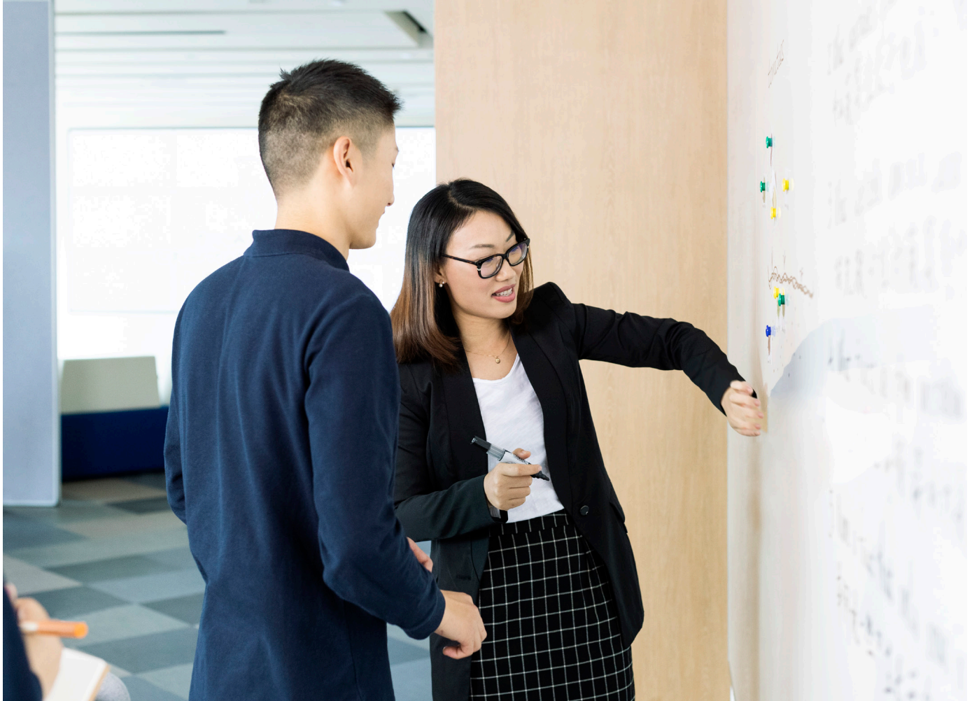
Full height PolyVision CeramicSteel whiteboards visualise and support the transfer of new concepts

Classrooms and shared spaces have been equipped with PolyVision CeramicSteel magnetic whiteboards. These full-height and 'collaged' writing canvases can be used either to display documents or write notes during class or around the centre, encouraging students with a sense of ownership over their own learning.