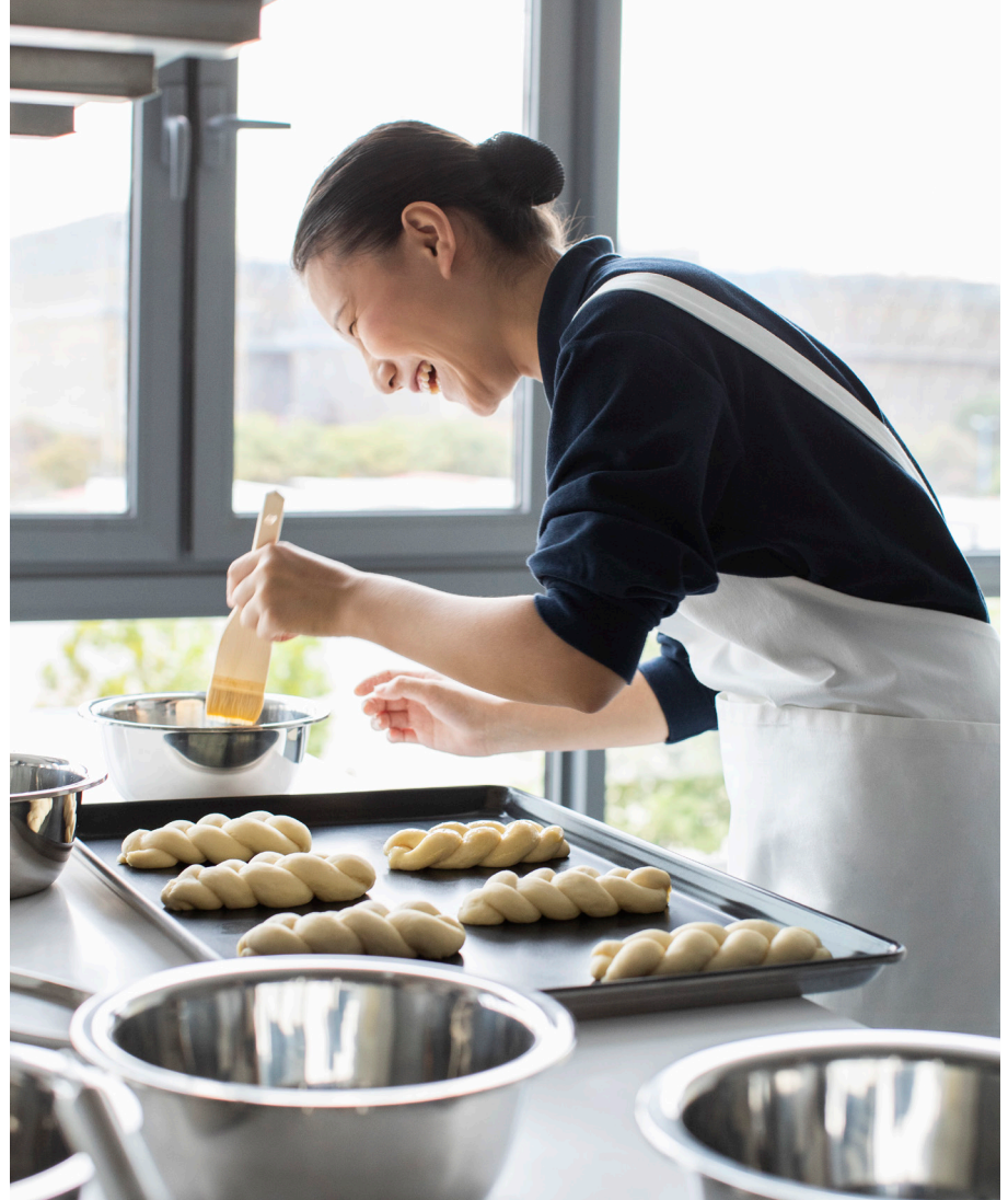
New commercial kitchens equip the centre for vocational learning

“The casual environment also makes it more friendly and less intimidating, which in turn reduces the ‘formality’ of a traditional learning facility and enables our staff to better connect with youths.”