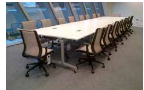
Meeting rooms have flexible furnishings that support meetings both large and small. Integrated cabling enables plug and play at the worksurface, speeding the sharing of information