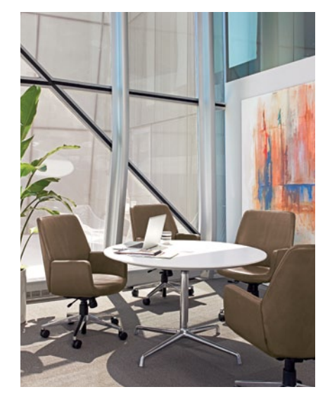
Bindu mid back executive seating shown with SW_1 table

Bindu offers a clear alternative in look and feel with its synchro-tilt mechanism and flex back, which enables users to fluidly change postures whether collaborating or computing.