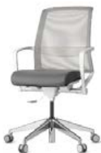
Light Grey Frame

For a comfortable and versatile leadership environment that invites discussion, with guest chairs for face-to-face dialogue.