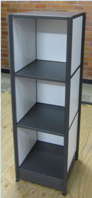
1 wide free standing units are only available up to and including 3 levels high.