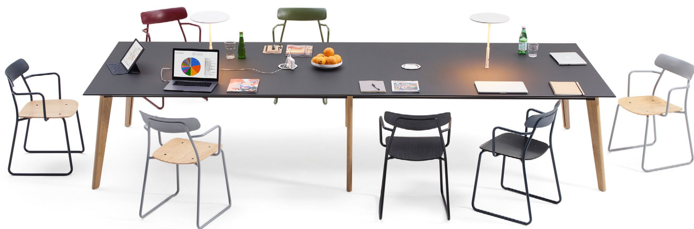
Top – ACORN-S & SA, Bottom – ACORN-SA