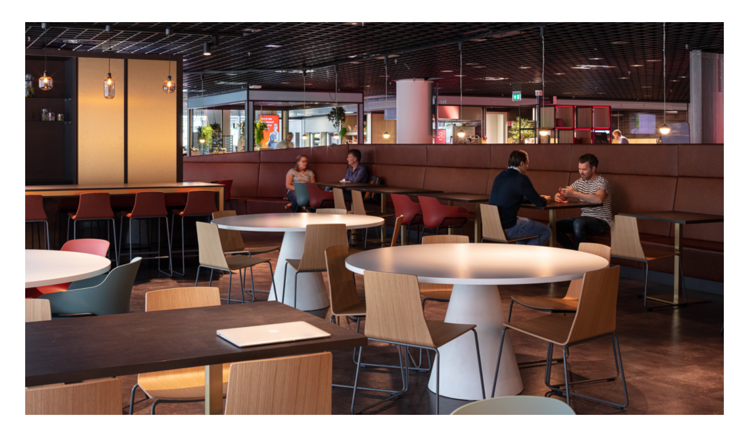
360: You're about six months into using this new workplace. What's next?

MS: They say the sky's the limit, but maybe we should look to something beyond that. I'd like there to be a moment where VodafoneZiggo is admired by the people we look up to. I want people to feel like there's no other place they can dream of working if they want to be themselves. We have an agile coach on our team who came to work here because two trainees already working with us said, "You have to come here. This office is amazing." He literally came to visit and said, "I need to work here." And, now he's part of our team, coaching multiple teams. People attract each other and learn from one another. Our environment is helping us invite people in to collaborate and learn together.