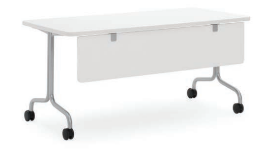
Train® A flip-top, reconfigurable table designed to support heavy duty technology needs.