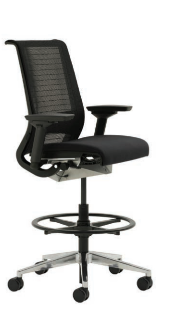
Stool with 3D knit back and upholstered seat