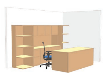
Currency Private Office 80 sq. ft.

Universal bin, lateral file, pedestal, shelf, storage, table, tower and worksurface, Elective Elements 6 shelf, Think seating