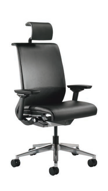
Upholstered back and seat with headrest