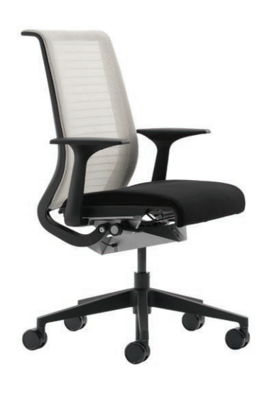
3D knit back with fixed arms