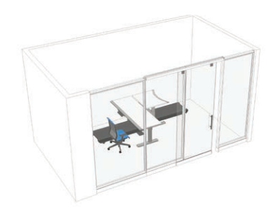
Walkstation Private Office 209 sq. ft.

Walkstations, Elective Elements 6 shelf, Think seating