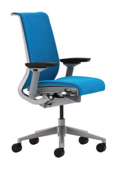
Upholstered back and seat