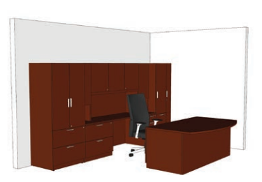
Walden Private Office 150 sq. ft.

Garland bookcase, credenza, desk and service module, Siento seating