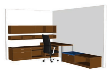
Elective Elements 6 Private Office 67 sq. ft.

Walden bookcase, cabinet, credenza, desk, service module and tower, shelf light, Siento seating