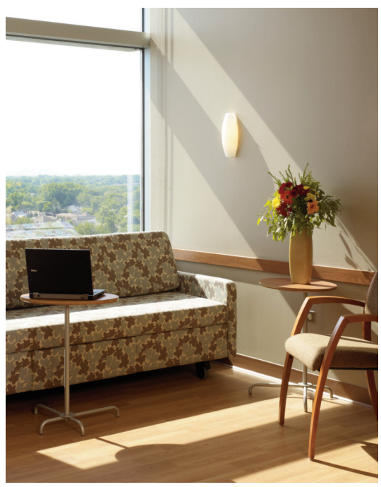
Sidewalk seating (above) with tablet arms provides visitors with functional comfort. Nurture's Sieste<sup>™</sup> family of sofa sleepers and recliners (below) were used in every patient room.