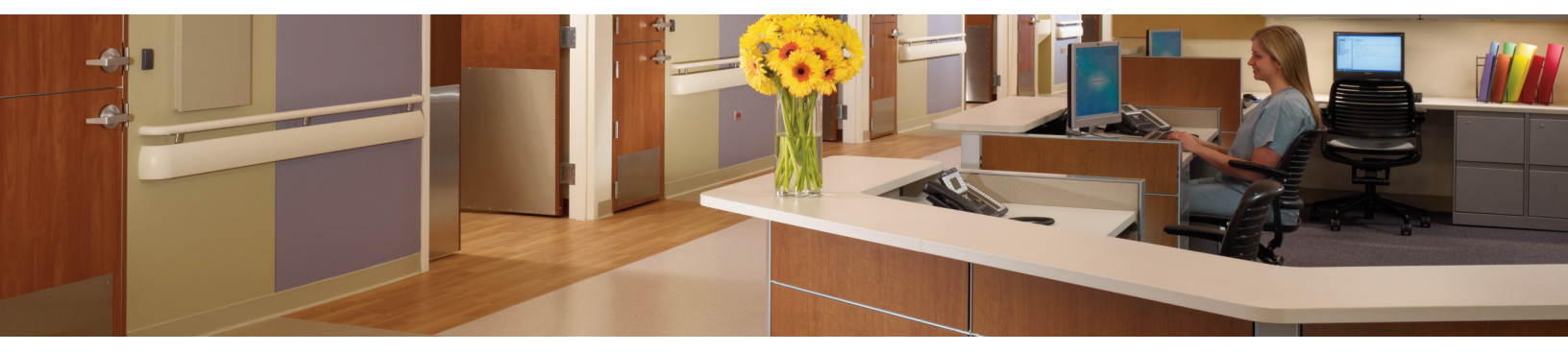
Montage was used for nursing stations due to its modularity and ability to match with specific functions while offering a crisp overall aesthetic.

"The use of stone, natural wood and decorative glass with plant features bring the restful, healing look of nature to the