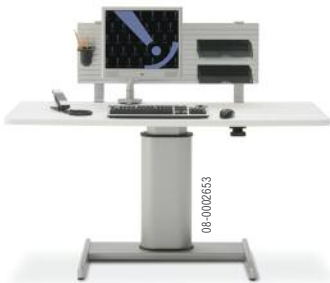
Airtouch Rectangular, seated height

So many ways to configure for so many different figures. Go figure.