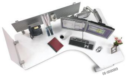
Series 7 90° Boot , overhead view