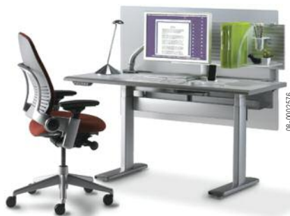
Series 7 Rectangular, seated height