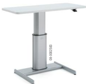
Airtouch Rectangular, standing height