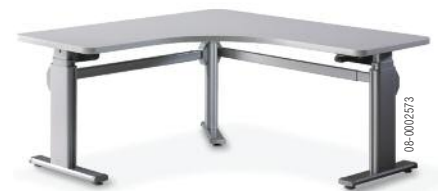
Series 5 120°, seated height