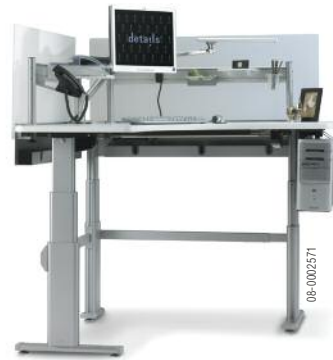
Series 5 90°, standing height