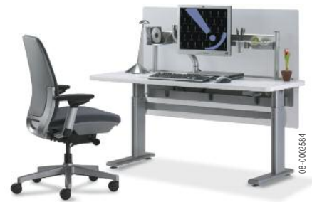
Series 3 Rectangular, seated height