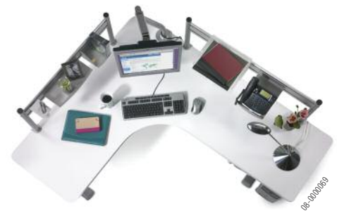
Series 3 90°, overhead view