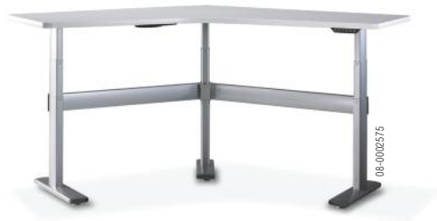
Series 7 120°, standing height