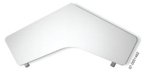
Series 3 120°, overhead view