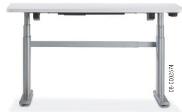
Series 5 Rectangular, standing height