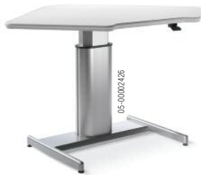
Airtouch Corner, seated height